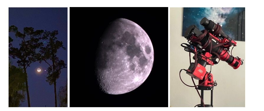
Figure 1 - Student photo of Moon with cellphone (left) vs moon with astrophotography equipment (middle). Astrophotgraphy equipment that we would like to purchase (right).

Efficient Use of Resources: The project outlined in this proposal efficiently uses existing resources and services and does not duplicate services or infrastructure.